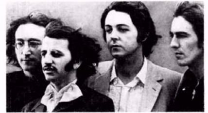
John, Paul, George and Ringo. Their latest... A seven minute long single called "Hey Jude!" On the flip side "Revolution". Enough said. The Beatles: Hey Jude (b/w Revolution) An Apple Single. Number 2276