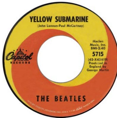
62-01B (Bert-Co print) Factories: Los Angeles

BEATLES — YELLOW SUBMARINE (Prod. Martin) (Writers: Lennon-McCartney) (Maclen, BMI)— ELEANOR RIGBY (Prod. Martin) (Writers: Lennon-McCartney) (Maclen, BMI)—With Ringo taking the lead, and everything in the arrangement but the kitchen sink, the group has their most unusual easy rocker to date. Flip is offbeat baroque ballad with equal potential for the No. 1 spot. Capitol 5715