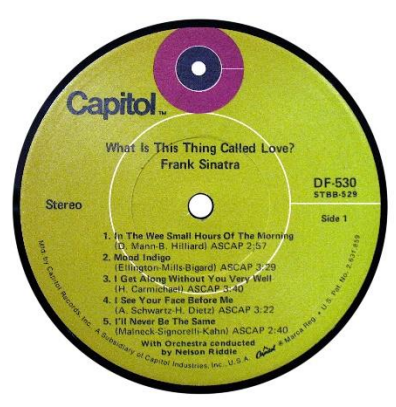
Label 69 Duophonic Green label with purple logo.

From 1970 to about 1978, Capitol issued In the Wee Small Hours under the title What is This Thing Called Love . With that name it was released separately as DF-530 and was paired with a reissue of another Sinatra album, Where Are You , as STBB-529. This time Capitol withdrew two more songs, "Glad to Be Unhappy" and "Deep in a Dream," from the set – leaving ten songs.