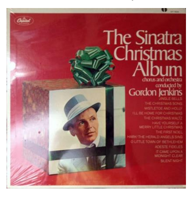
Label 62 Mono