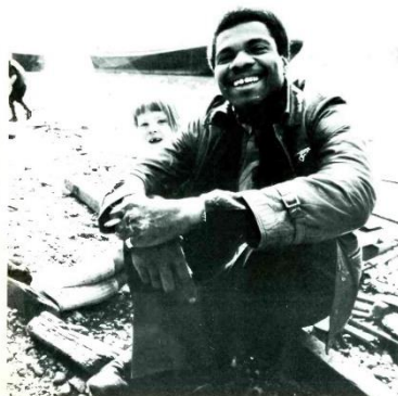
Produced by George Harrison

BILLY PRESTON 'Everything's all right' b/w 'I want to thank you' OUT NOW Apple