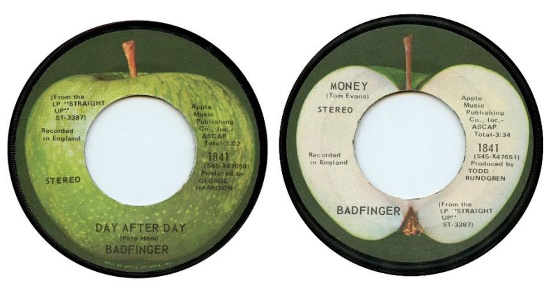
Label af1J (Jacksonville) has the album title in the upper left on side A.