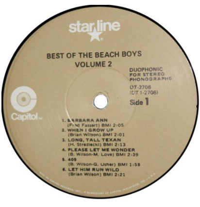
Label SL72-D01W - Pressed by Winchester