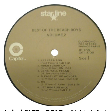
Label SL72r-D01B – Rights info in rim