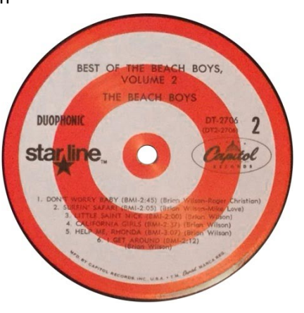
Label 62-D01L – Pressed at Los Angeles