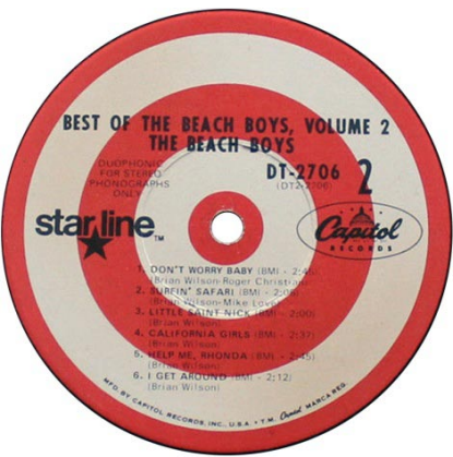
Label 62-D01J - Pressed at Jacksonville