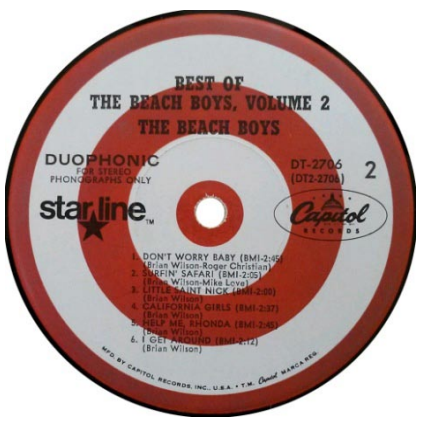
Label 62-D01S - Pressed at Scranton