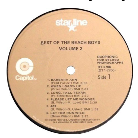
Label SL72r-D01A – Rights info in black on label A non-Capitol pressing of the above record is known.