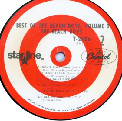
Label 62-M01J - Pressed at Jacksonville