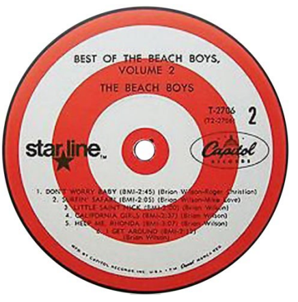
Label 62-M01L – Pressed at Los Angeles