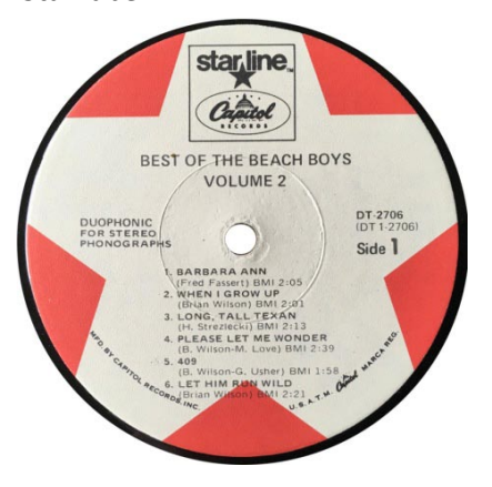
Label SL69-D01J – Pressed by Scranton, Jacksonville