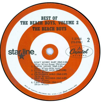
Label 62-M01S - Pressed at Scranton