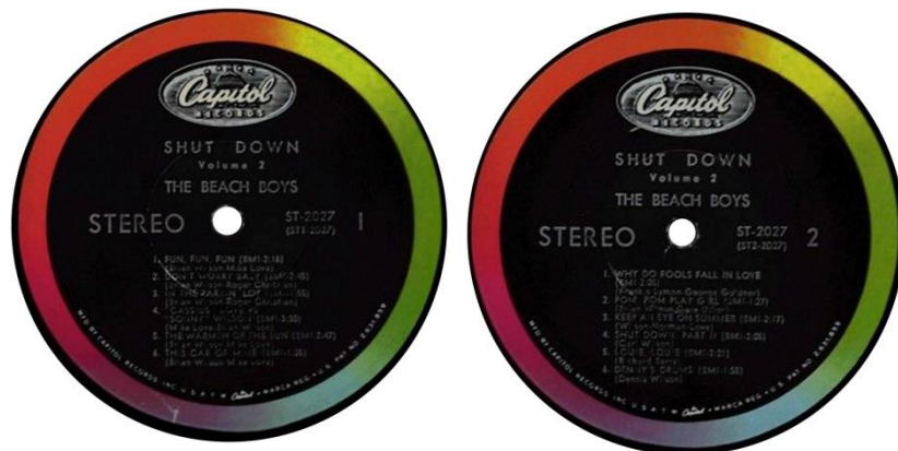
Label 62-S02S – Pressed at Scranton