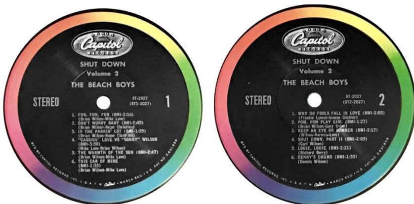
Label 62-S02L – Pressed at Los Angeles

Label S02L(i) [above] has wide spacing in the lines at the top. On side 1, the ( before the matrix number is over the 6 in the song time for “Fun, Fun, Fun.” On side 2, the ( before the matrix number is over the I in IN.