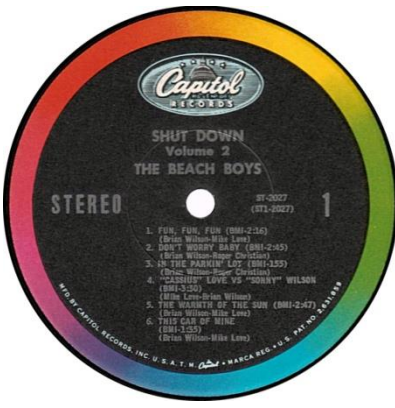
Label 62-S03L – Pressed by Los Angeles