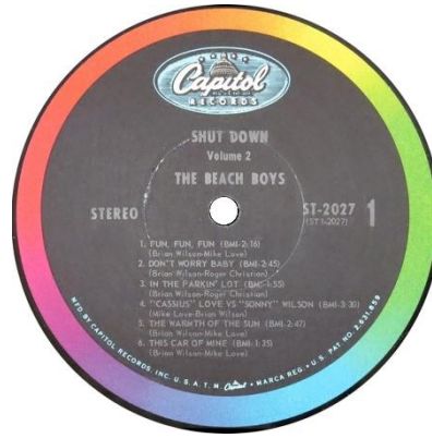
Label 62-S03J – Pressed by Jacksonville

Although the album remained in print in the tape formats at least through 1967 – and probably later, it appears that no new orders for albums were made during that time. In 1971 the record was reissued in abridged form under the title Fun, Fun, Fun (Capitol SF-702).