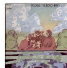
POP FRIENDS—The Beach Boys. Capitol ST 2895 (S)

The Beach Boys need no introduction to dealers across the nation. With their proven salability, the group should score high on the charts with this, their latest album. Included is their current single, the title tune, plus several other good songs. "Anna Lee, the Healer" is a catchy number as is "Transcendental Meditation."