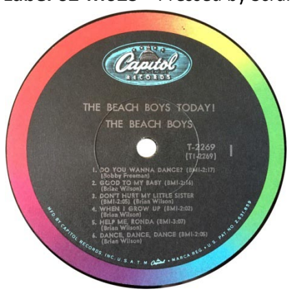
Label 62-M02L – Pressed by Los Angeles

There is more space between title and artist name here than on M01L.