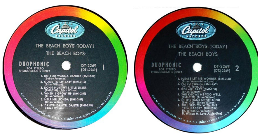
Label 62-D01S - Pressed at Scranton

Black rainbow label with logo at top, and no subsidiary print. Semi-glossy labels