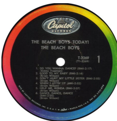
Label 62-M01S – Pressed at Scranton, Decca-Pinckneyville