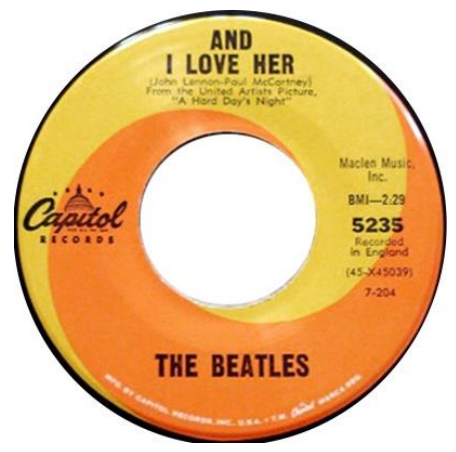
02L (Bert-Co print) Factories: Los Angeles