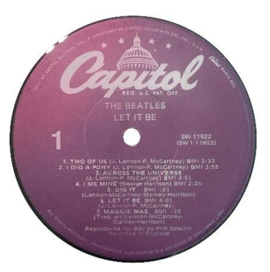
Label 78 Stereo SW-11922 Purple label with large logo Factory: Los Angeles, Jacksonville, Winchester, Goldisc

Posterboard, single-pocket cover. The images that had been inside the gatefold cover now appear on the album's inner sleeve. Early copies came with a poster of the album cover.