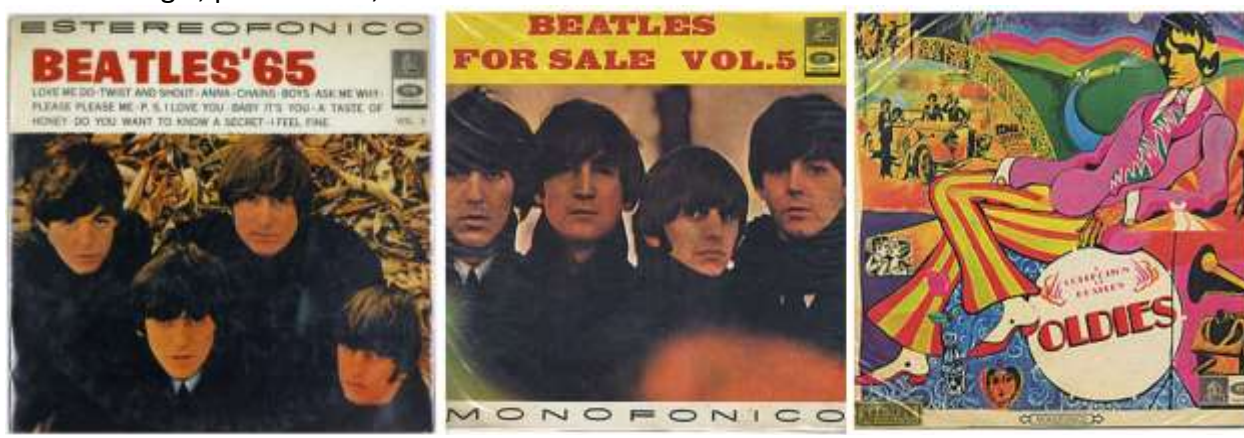
NOTE 3 : By the time A Collection of Beatles Oldies came out in 1967, the large bands at the top and bottom of the cover (for stereo and mono) had been reduced in size to much more tactful labeling. A Collection of Beatles Oldies was not the same as the British album. In Colombia, the album contained: "Can't Buy Me Love," "Bad Boy," "Day Tripper," "Penny Lane," "Slow Down," "Yellow Submarine," "Paperback Writer," "From Me to You," "We Can Work it Out," "Strawberry Fields Forever," "Rain," and "Match Box." This was one of the first LP's worldwide to contain the sides of the "Strawberry Fields Forever" single.

NOTE 2 : Volume 4 contains the Hard Day's Night LP, minus the "Can't Buy Me Love"/"You Can't Do That" single, plus "Komm, Gib Mir Deine Hand."