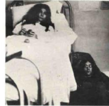
John Lennon/Yoko Ono: (Zapple ST 3357)

One's by John Lennon and Yoko Ono. It's called 'Life with the Lions'.