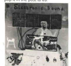
George Harrison: (Zapple ST 3358)

some book shops. If you're not sure what a 'leading' record shop is and whether there's one near you, fill in the coupon below and pop it in the post to us.