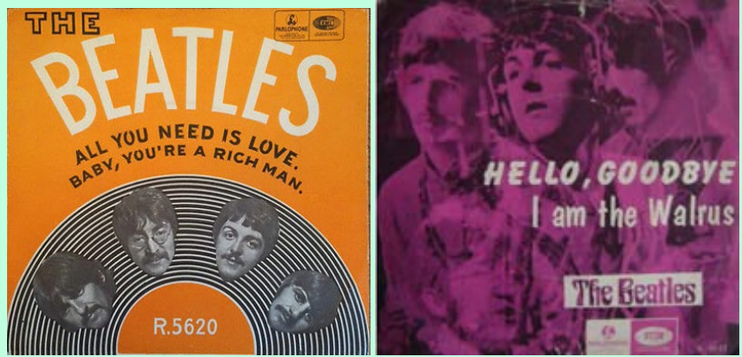
The singles originally released on these label styles were as follows:

At the beginning of 1967, both the Parlophone-EMI and Odeon labels changed to a black label with the logo at the side. These labels more closely resembled those used in Denmark. The earlier records were all reissued into the new style, although the Odeon label remained on the old style and was now used only for reissues. Essentially, the Odeon label ceased to exist for new Norwegian Beatles records.