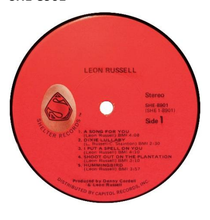
Leon Russell SHE-8901