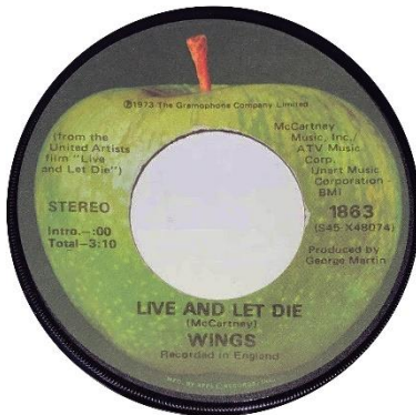
B-side label the same as af2W.

Label af2L has the song times under STEREO at the left. Factories: Los Angeles, Jacksonville